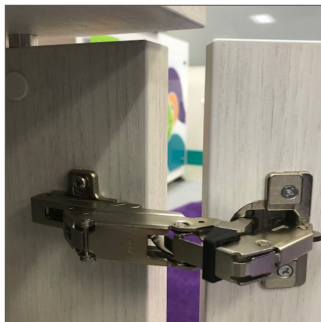
135° heavy-duty hinges with no exposed substrate.