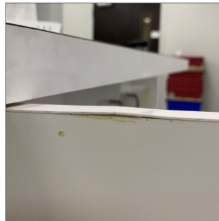
Peeled edges are unsanitary and unsightly.