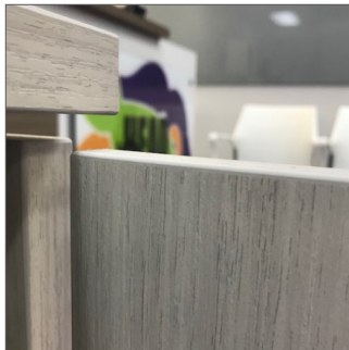
FUZE edges will not peel.